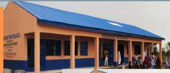
FAWOYDI / TY DANJUMA FOUNDATION SCHOOL IN 'AKWATSHINGE, ASS LGA, BAUCHI STATE.