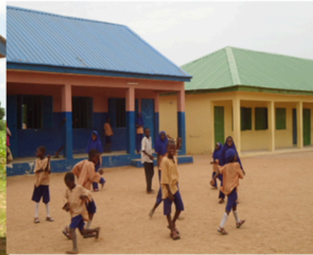
FAWOYDI Constructed Primary School, in Fulataran community of Darazo LGA, Bauchi State. Supported by T.Y Danjuma Foundation.