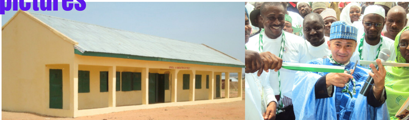
Commissioning of Gwllagan Mayaki Primary School by the Head of Mission Japan Embassy, constructed by FAWOYDI at Bauchi LGA, Bauchi State in the year 2011