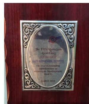
Some of our Award received by FAWOYDI